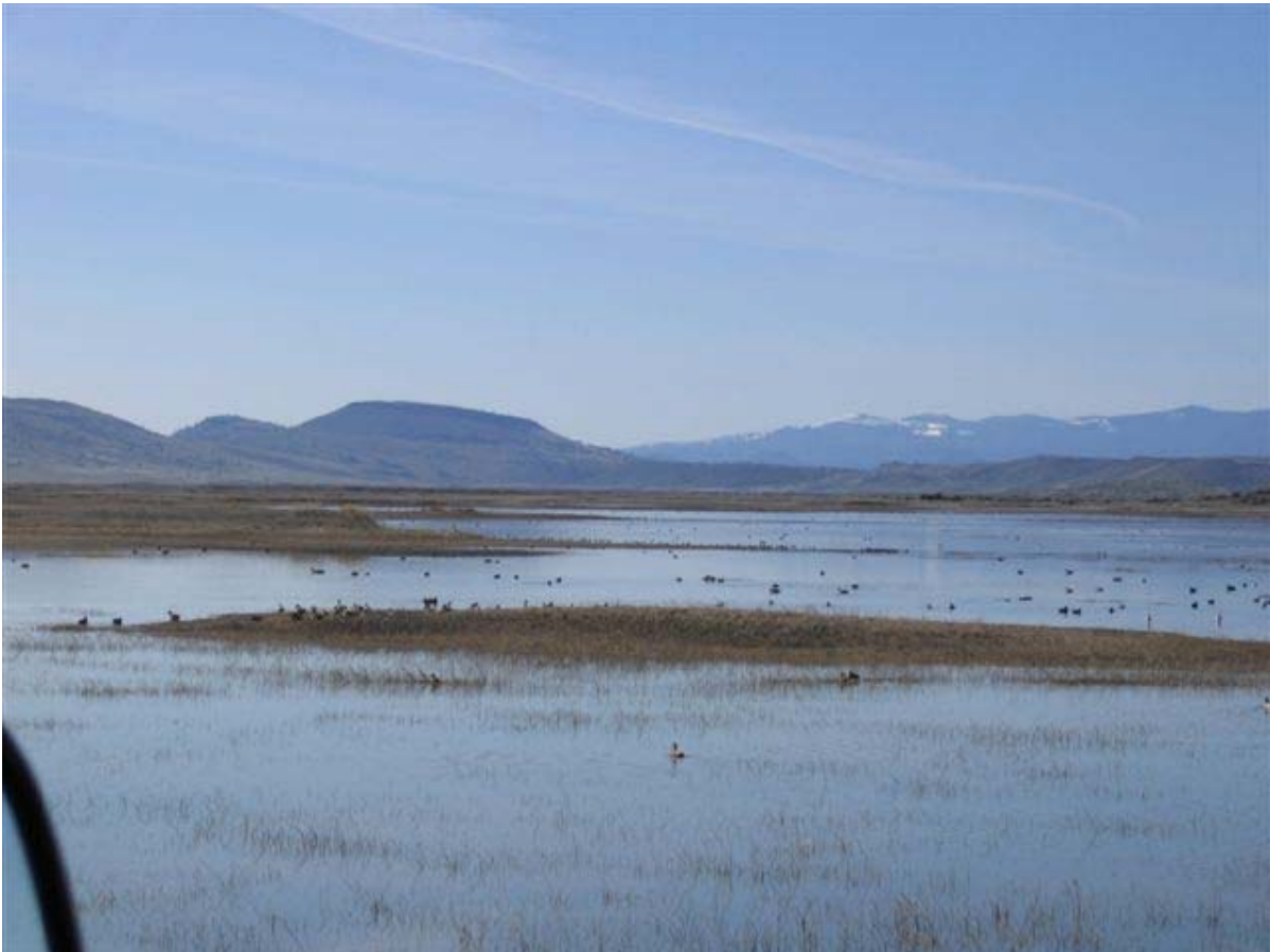
Typical view of White Lake area