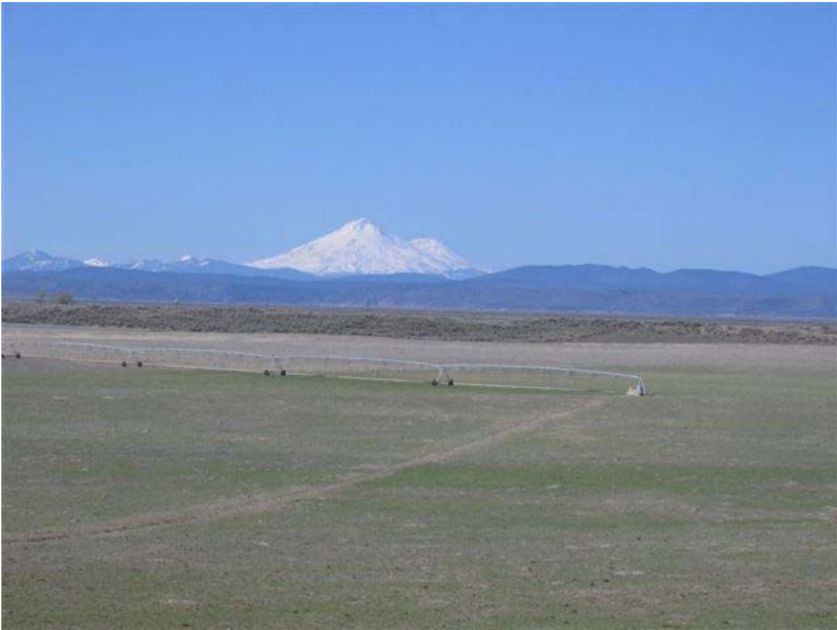
Pivot & Mt. Shasta